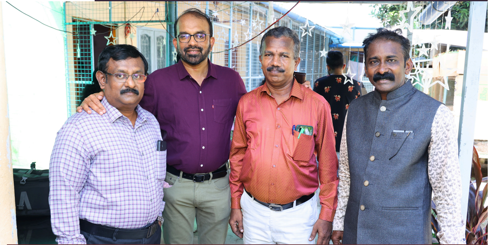
BOARD OF TRUSTEES & MEMBERS OF HURRICANE VETS CHARITABLE TRUST AT KUDUMBA VEEDU, AN OLD AGE HOME AT PARVATHIPURAM, NAGERCOIL

Caring for the elderly involves providing emotional support, medical assistance, and a safe environment, ensuring dignity, comfort, and a sense of belonging in their later years. Elderly people at old age homes often find companionship and care in a supportive environment. These homes provide essential services, fostering a sense of belonging and emotional well-being. While some may feel isolated from their families, engaging activities and peer relationships help them rediscover joy, dignity, and purpose in their later years. Hurricane Vets Charitable Trust (HVCT), Chennai supports elderly care by providing medical aid, emotional support, and community resources, ensuring dignity, well-being, and enhanced quality of life.